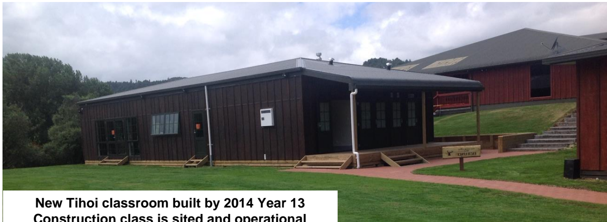
New Tihoi classroom built by 2014 Year 13 Construction class is sited and operational