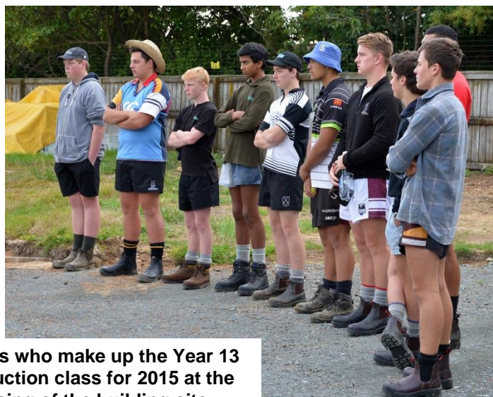
The boys who make up the Year 13 Construction class for 2015 at the blessing of the building site