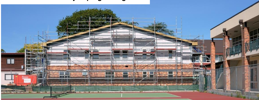
Williams House Project progressing well

Construction of the Centre of Excellence for Agricultural Science and Business™ has begun, with the laying of pipes for services and the preparation work for the car park being the initial areas of work undertaken. The formulation of the car park is being done first to make for easier access by trucks and contractors once the cooler/wetter weather of autumn arrives. The later than anticipated start of this project has seen the expected completion date revised to mid-June.