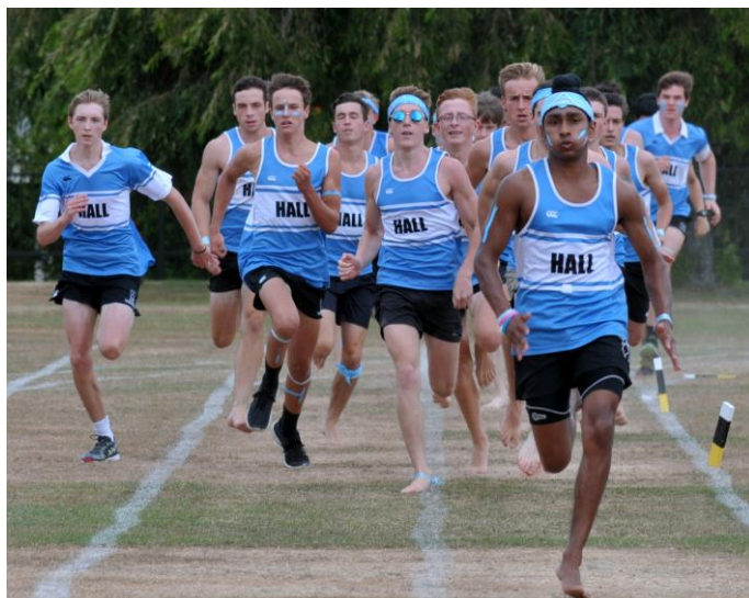
Athletic Standards Held on Friday, 30 th January