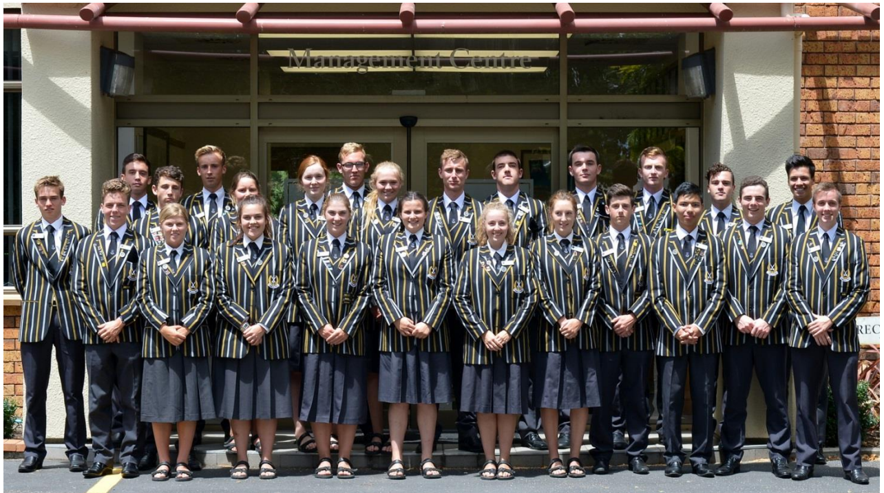
2015 Full School Prefects leading from the front

If the start of 2015 is anything to go by, then the St Paul's Collegiate School community can be satisfied in the realisation that it is blessed with an impressive calibre of leadership within its student body. This is not just limited to the Prefects and Year 13 students, but in fact across all Year levels. Events like the opening Powhiri, Athletic Standards, Athletic Sports, and Year 11 Activities Day have highlighted the pride students have in themselves and their Houses/School, and also the inclusive and competitive culture that currently exists.