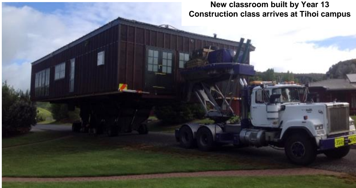
New classroom built by Year 13 Construction class arrives at Tihoi campus