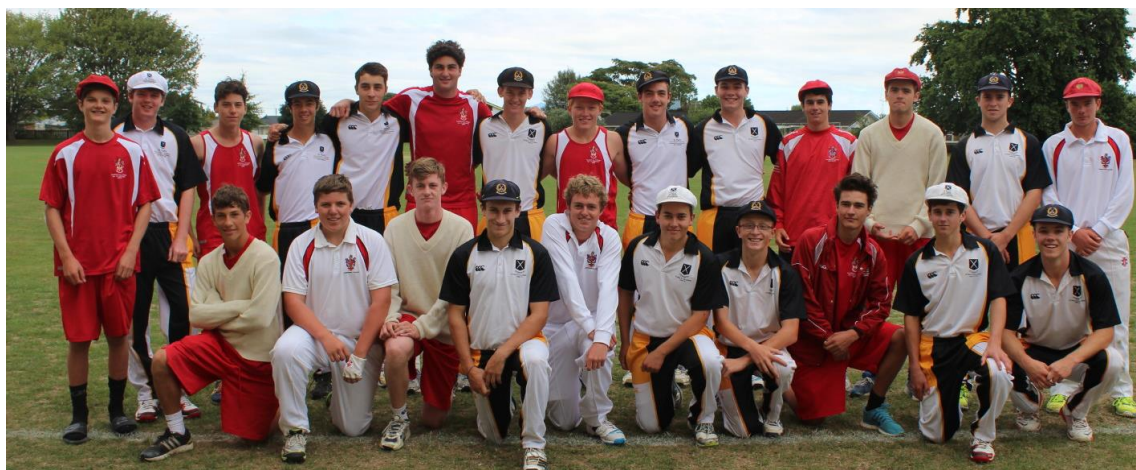
Annual summer exchange with Lindisfarne College