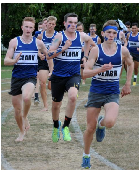
House Competition Begins