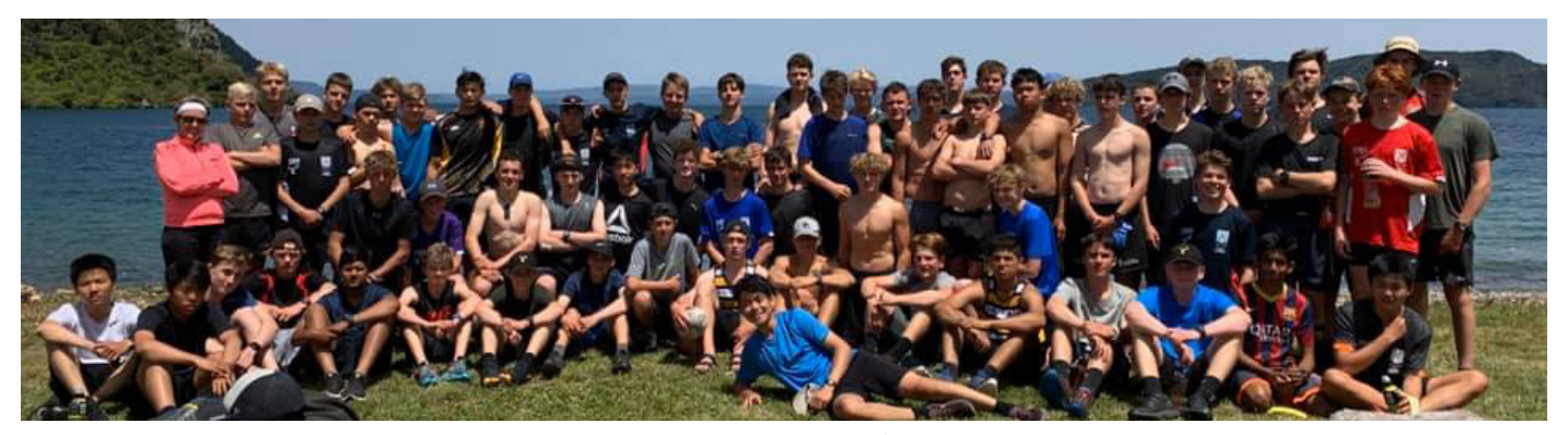
Tihoi intake 2019/2

MORTIMER PRIZE FOR MOST OUTSTANDING STUDENT