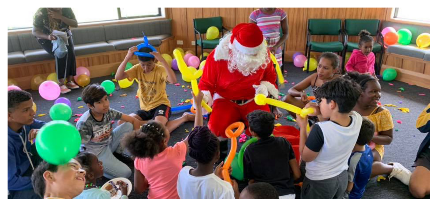
"Santa" at the annual Refugee Christmas Party